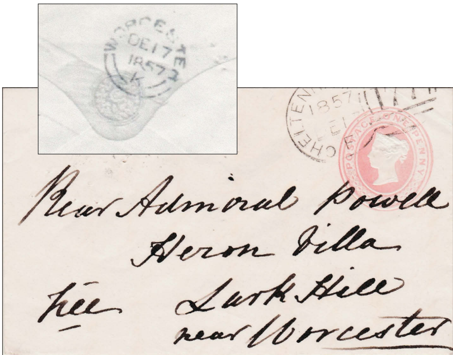
Fig. 2 PROVENANCE: JOHN HINE