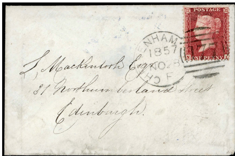
Fig. 1 — A new example of the rare Cheltenham Spoon.